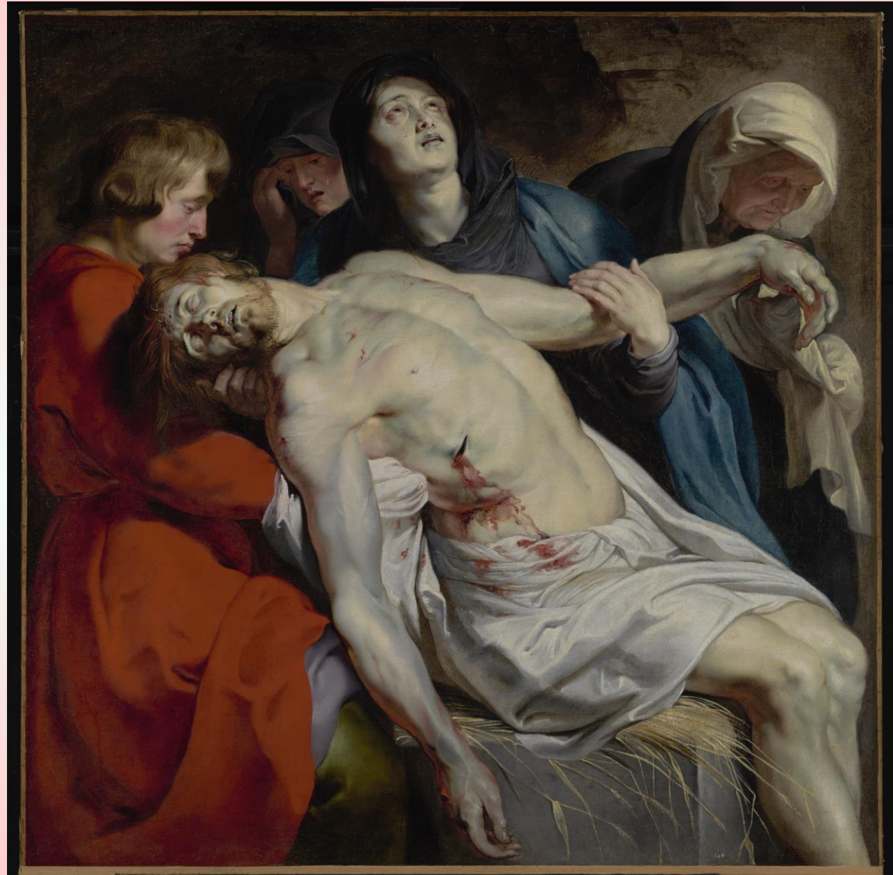
“The Entombment”, Ruebens

What about Sunday morning, the beginning of the workweek, when you are going to see the tomb, according to Matthew 28:1?