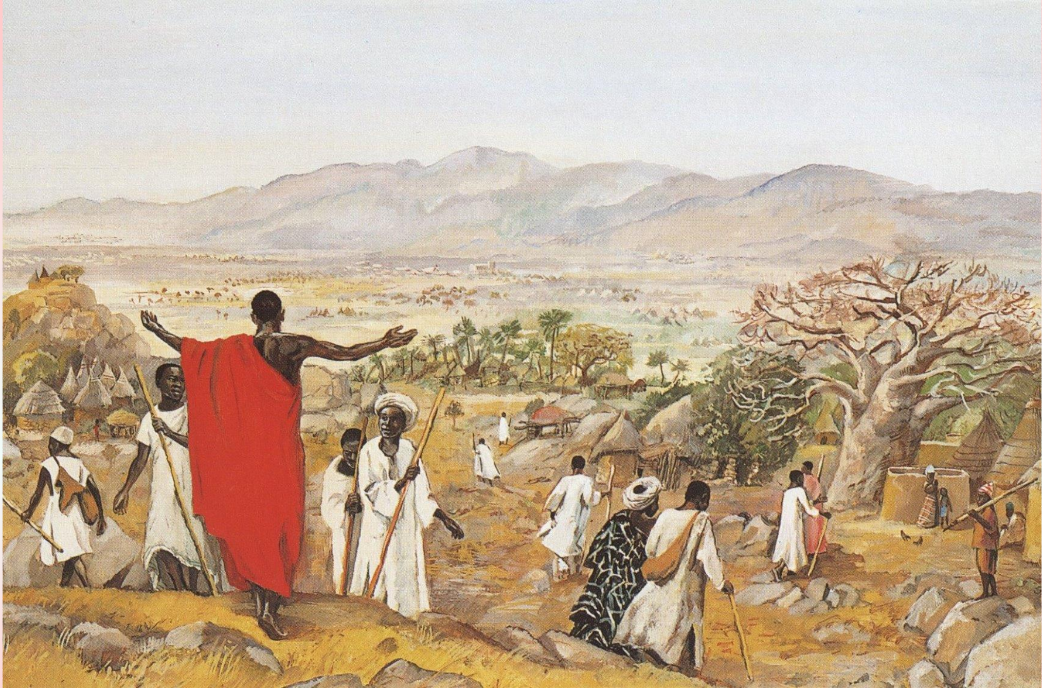
"The Mission to the World", Jesus MAFA Project