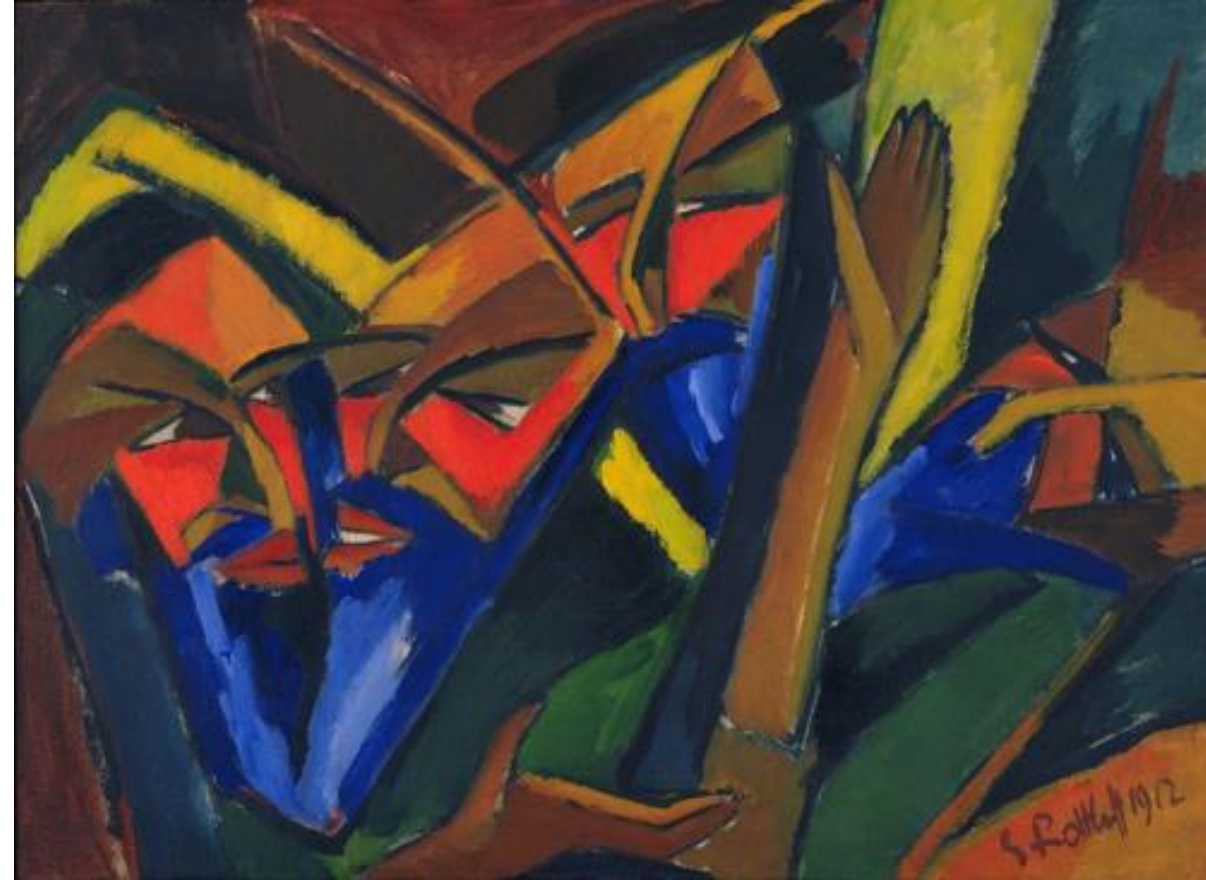
Pharisees , Karl Schmidt-Rottluff

At minimum, note section headings and verses