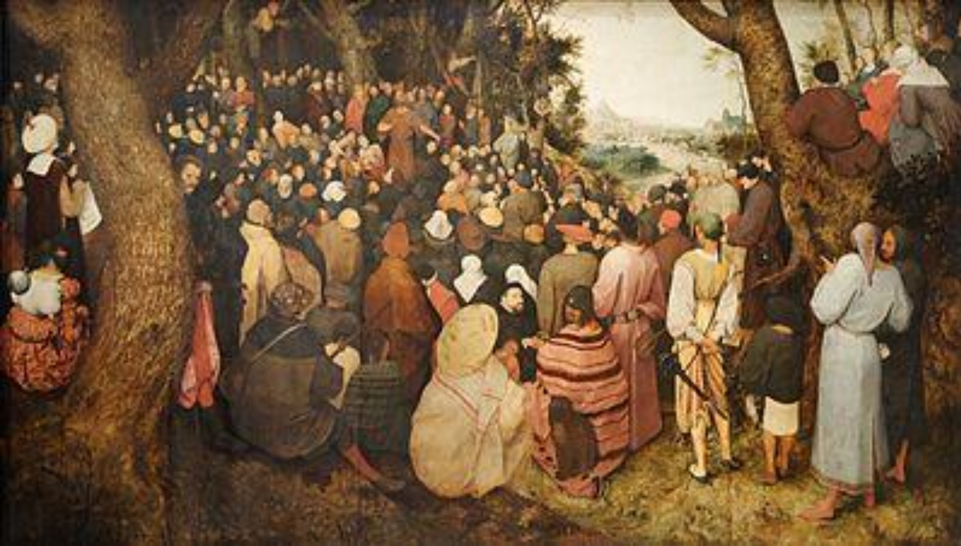
The Preaching of St. John the Baptist by Pieter Bruegel the Elder, 1566

“Repent for the Kingdom of Heaven is at hand.”