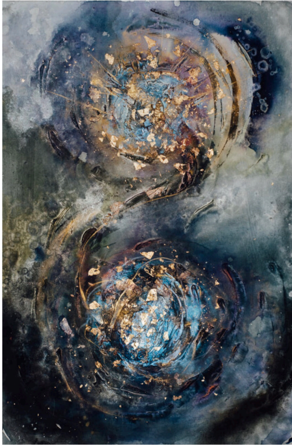
LEV / HEART: seat of intellect and emotional capacities // SOLD